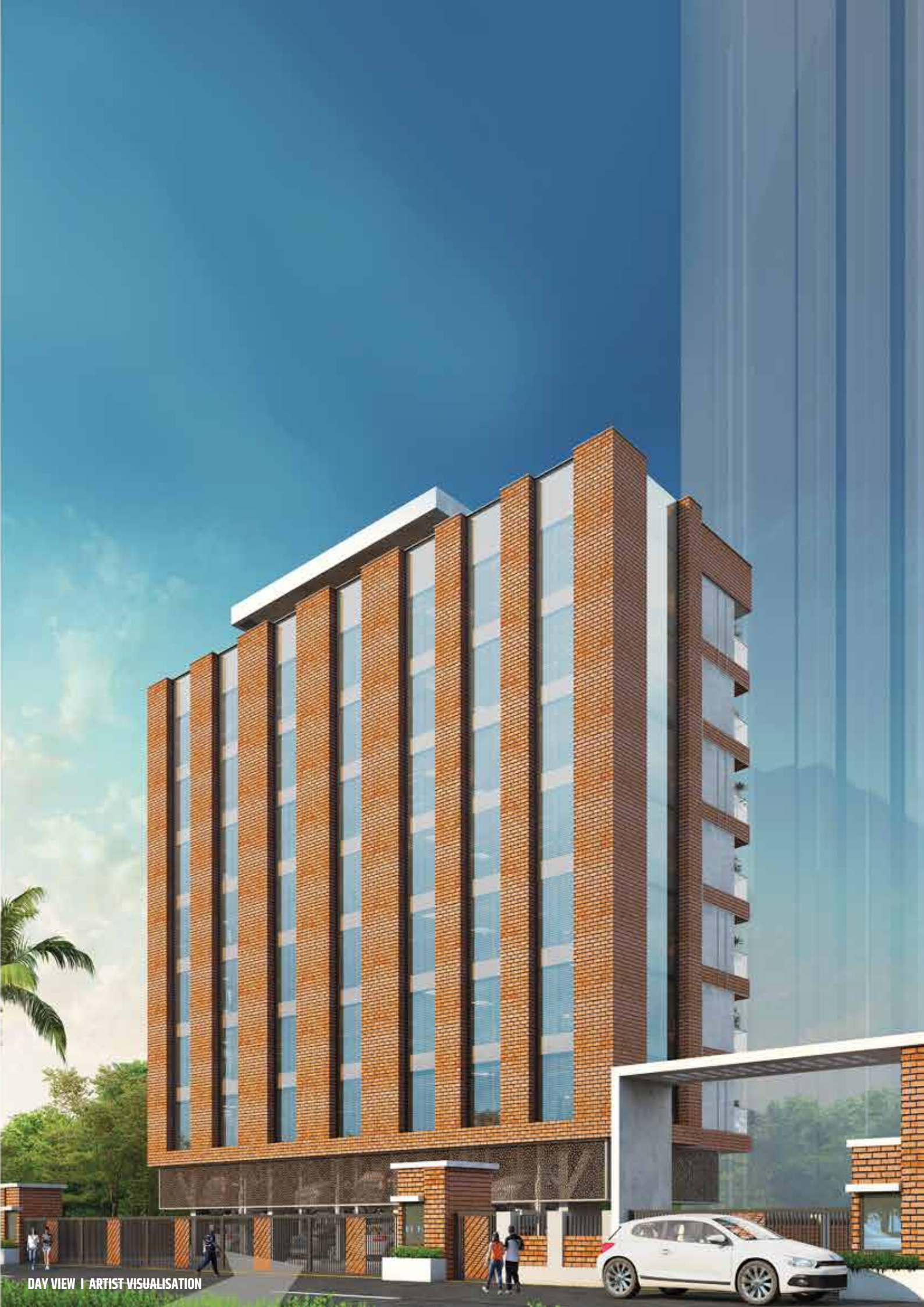
DAY VIEW | ARTIST VISUALISATION